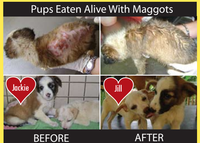
Pups Eaten Alive With Maggots