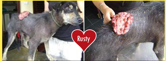
Huge Maggot Infested Wound

You can sponsor Rusty for just £10 per month to help pay for his keep and veterinary treatment at the sanctuary. Please see our sponsor a dog scheme in this newsletter.