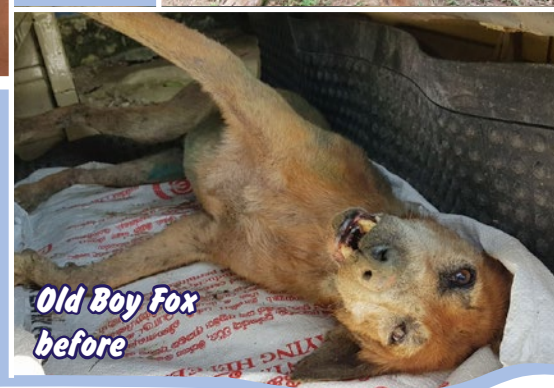
Old Boy Fox before

We rescued this sweet old boy as he was literally on his last legs after a harsh life on the streets. He was so weak, malnourished and dehydrated, we were not sure if he would survive. We pulled him through to enjoy his twilight years at the sanctuary.