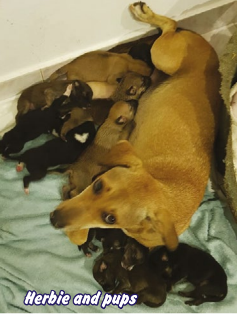
Herbie and pups