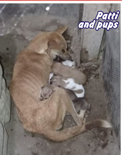
Patti and pups