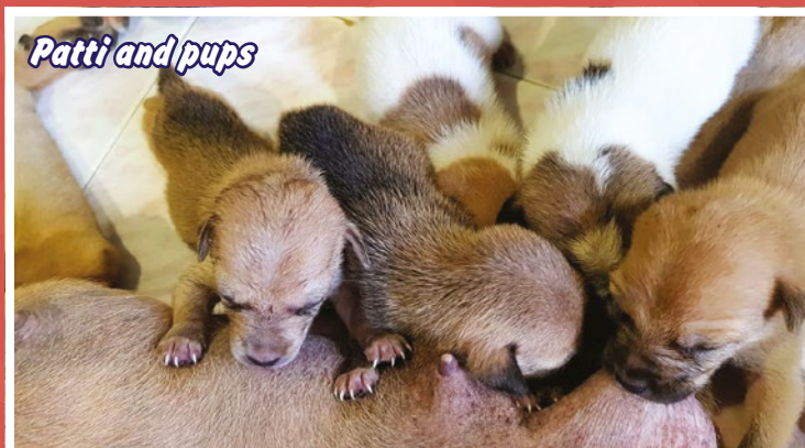
Patti and pups