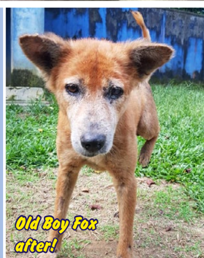
Old Boy Fox after!