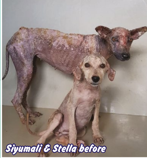
Siyumali & Stella before

were alerted to them by a kind tourist. Despite being full and dangerously low on funds, we agreed to give them a lifeline. We caught the pup who we named Stella, first. However, mum was suddenly missing and we feared the worst, that it was too late for her. After a few worrying days, she turned up and arrived at the sanctuary. We named her Siyumali. Both mum and pup are now reunited and nursed back to health. Both dogs had horrific skin conditions, painful wounds and were