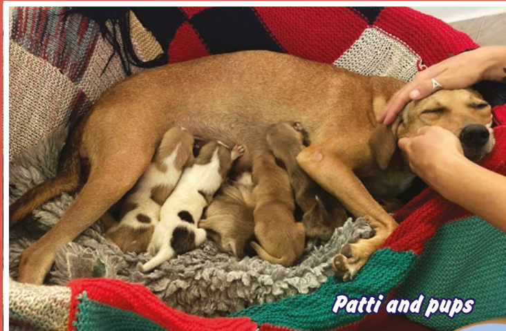
Patti and pups