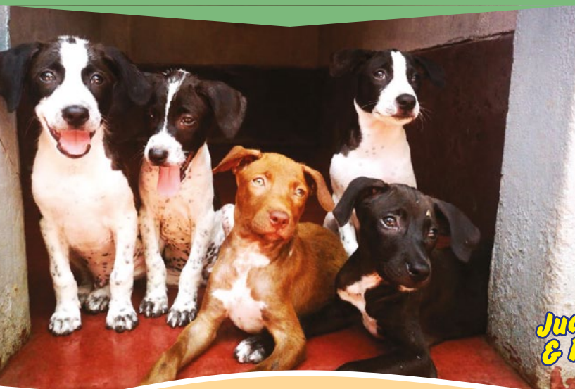
Judy & Pups

We heard that a heavily pregnant dog had been dumped in the village and was being attacked by some locals who wanted her to abort her pups. We rescued her just in time and she gave birth to 5 healthy pups the next day. Once old enough, we sterilized the whole family and found the perfect home for one of the pups. We are hoping to home the others too. Judy, the mummy dog, remains with us and is a gentle and highly intelligent girl.